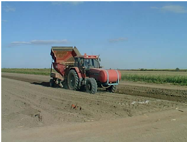
Figure 1: GUANO® / REEFSAFE® rows being planted.

The field was planted with a conventional cane billet planter, as shown in Figure 1.