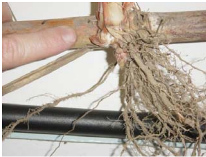
GUANO® / REEFSAFE® sett