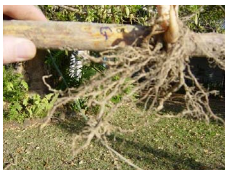
GUANO® / REEFSAFE® treatment