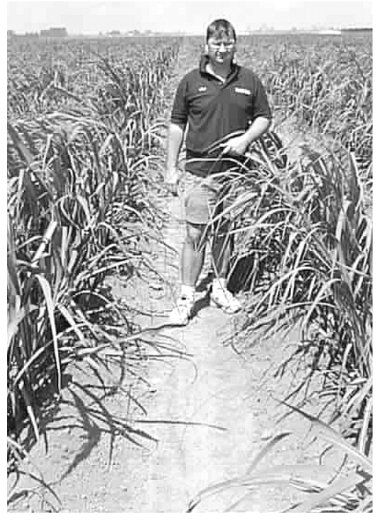
Sugar cane rows in the trial at Bundaberg

"We also noted a higher rate of residue phosphorus and silica in the soil. The trials also demonstrated the product's versatility - it blended easily with oth-