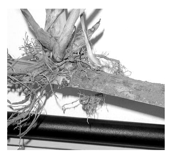
Sugar cane shoots from a plant fertilised with conventional fertilisers during the trials at Bundaberg.

For Trial Data and Technical information consult the new websites www.reefsafe.com.au and www.guano.com.au and www.agrispon.com.au