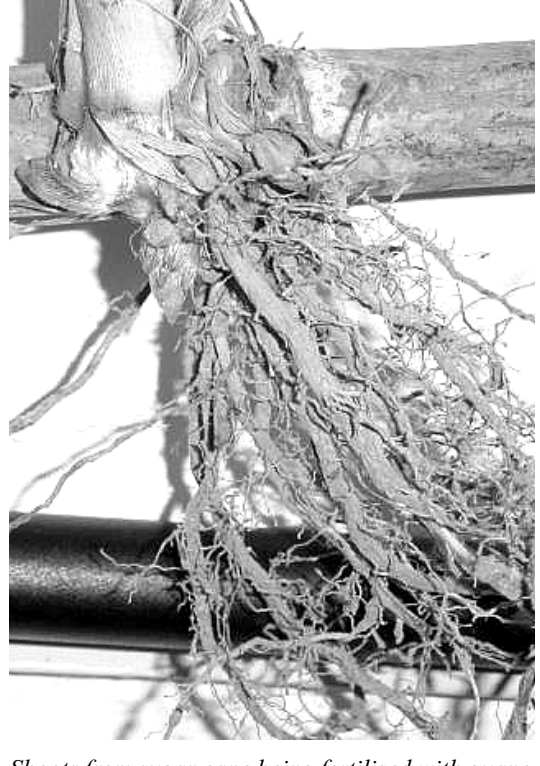
Shoots from sugar cane being fertilised with guano