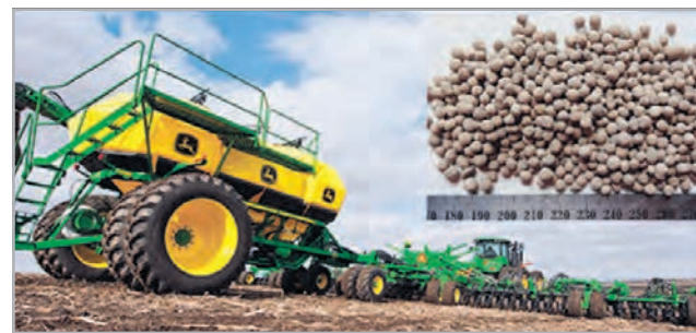
Guano Sulphur Gold® Airseeder. Tested & Proven!