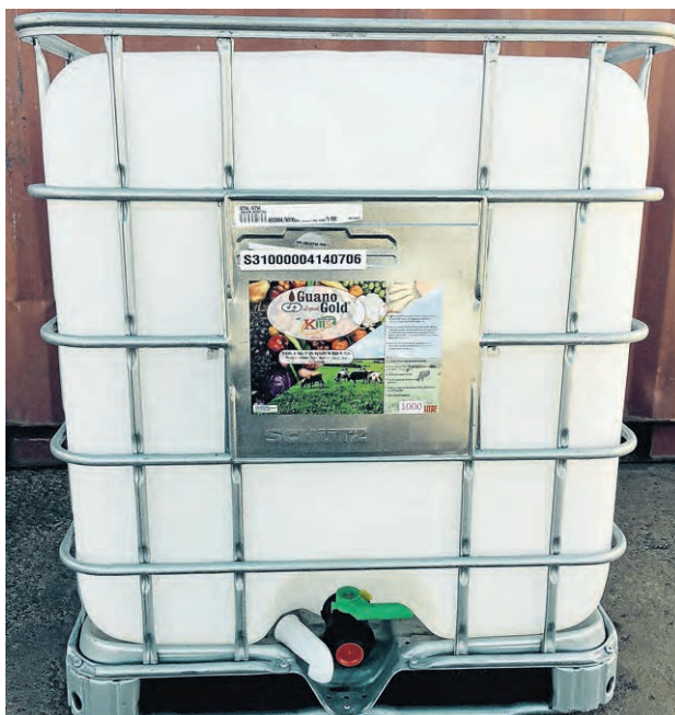
Guano Liquid Gold® & Guano Liquid Gold with KMS® are both available in 15L pails & 1000L IBC tanks.