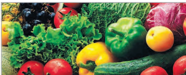
Guano Liquid Gold® & Guano Liquid Gold with KMS® are both suitable for foliar, fertigation & liquid injection.