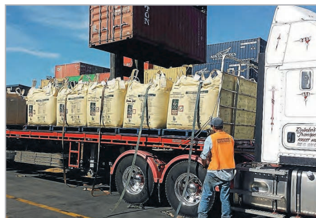
Guano Gold® products being loaded & trucked nationally.

100% Available P & K With GUANO GOLD® SPLIT P